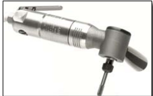
Model 44RAC angle grinder shown with built-in 1/4" collet for use with carbide burs or mounted points.