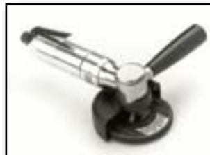
Model 44RA angle grinder shown with 4" guard.