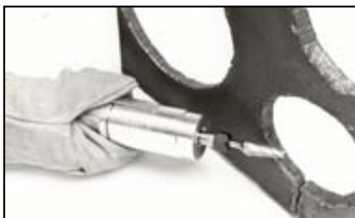
Front exhaust blows chips away from the operator.